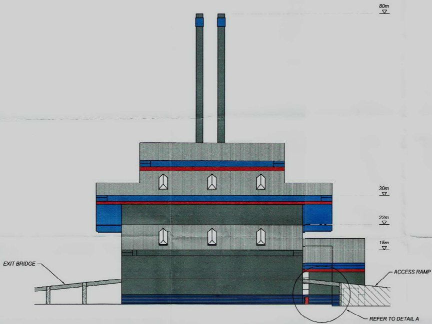
SOUTHERN ELEVATION SCALE 1:500